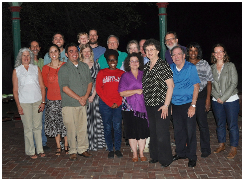
Some of those who joined the celebration