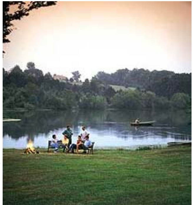
Above: The lake at Cedar Creek Conference Center

Located at the Cedar Creek Conference Center in New Haven, Missouri (about one hour from the University), this year's workshop will be able to accommodate 25 participants. We are asking participant's departments to contribute $150 toward the cost of books and materials for the workshop. CTE will cover the remaining costs. Faculty will be sent a letter inviting you to self-nominate for attendance at the Retreat. Completed nomination forms should be returned to CTE no later than February 21, 2003. Due to the format of the workshop and its expected outcomes, it is essential that nominees participate in both days of the workshop.